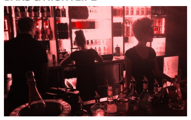
DosenPaparazzi (image cropped)

Dortmund used to produce more beer than virtually any other city in the world, so do not leave without trying a glass or two. Dortmund's bars cater to all tastes, and with so many students in town, cheap and cheerful is as easy to find as chic or cool.