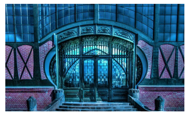
Polybert49 (image cropped)

Dortmund offers their visitors a wide range of interesting museums, theatres and of curse, world-class football. The city has a lively and versatile cultural life and there are million ways to spend your time like visiting the Museum of Art and Cultural History or go to the opera or museum. There is also the brewery where you will learn more about the history of industrially brewed beer in Dortmund.