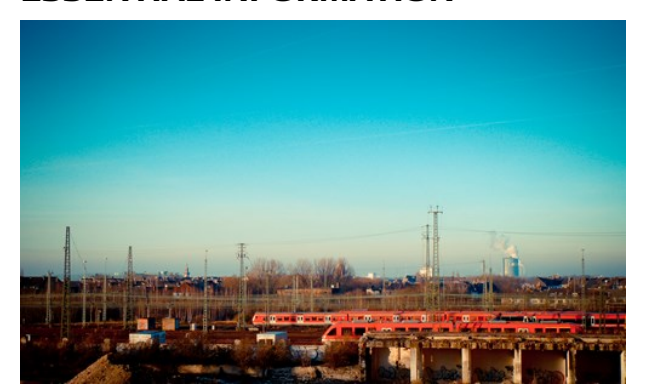
angsthase. (image cropped)