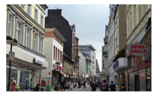
Erich Ferdinand (image cropped)

Shopping is one of Dortmund's principal attractions, attracting consumers from all over the country. Much of the shopping is done in the very heart of the city. As many as 12,000 shoppers an hour pass through Westenhellweg and its continuation, Ostenhellweg, attracted as much by the huge range of shops as the highly-competitive prices. Department stores like Kaufhof, electronic retailers, chain stores, food stores, health and beauty stores: they're all here.